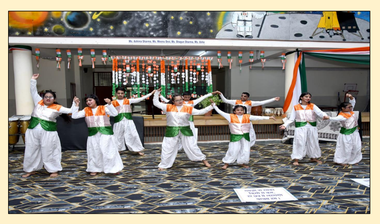
GRIID special students performing dance