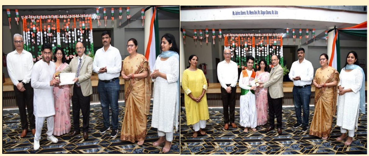
GRIID special students awarded commendation certificate