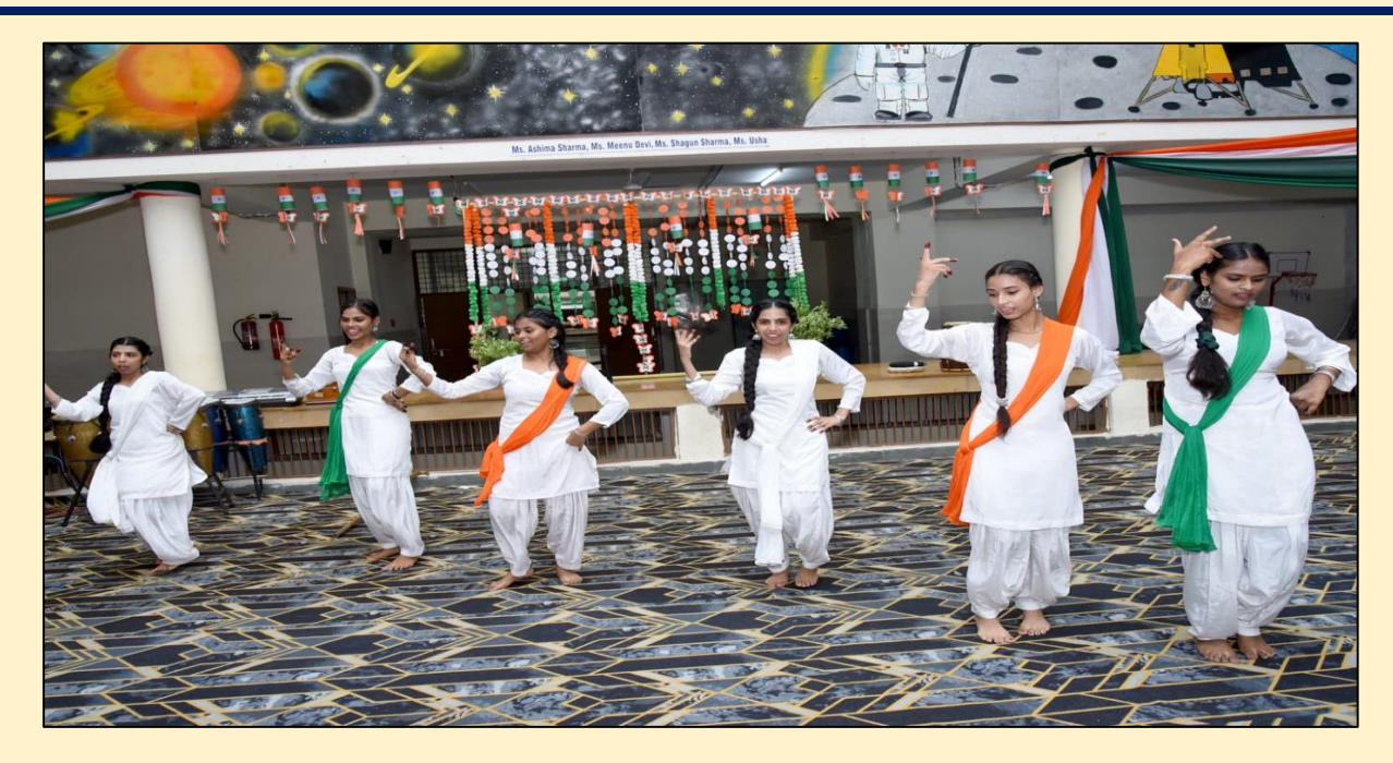
GRIID college students performing dance