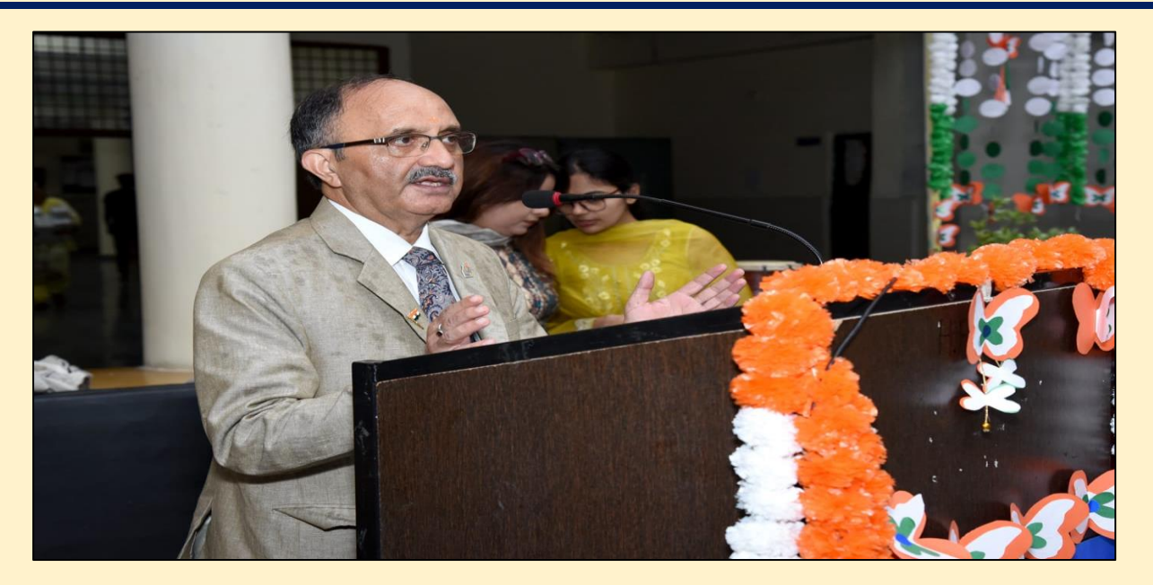
Director GRIID addressing the audience