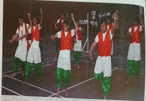
Cultural Program at the Mega Sports event

Special Olympics Bharat Chandigarh, Special Olympics Himachal Pradesh, Rotary members, and the Social Welfare Department of Chandigarh jointly organised the North Zone Mega Sports event, RYLA (Rotary Youth Leadership Awards) at the Punjab University from 11-13 December 2023. A total of 177 athletes and coaches from 6 states, Jammu & Kashmir, Punjab, Haryana, Uttarakhand, Chandigarh and Himachal Pradesh, participated in a multitude of