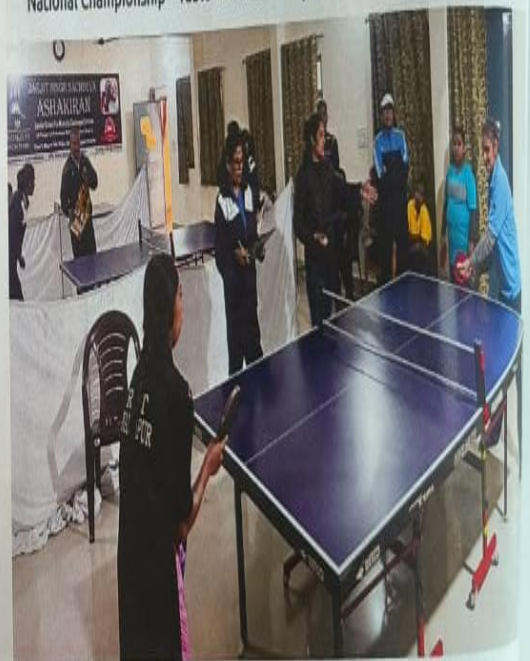
National Championship – Table Tennis (Female) held in Hoshiarpur Punjab