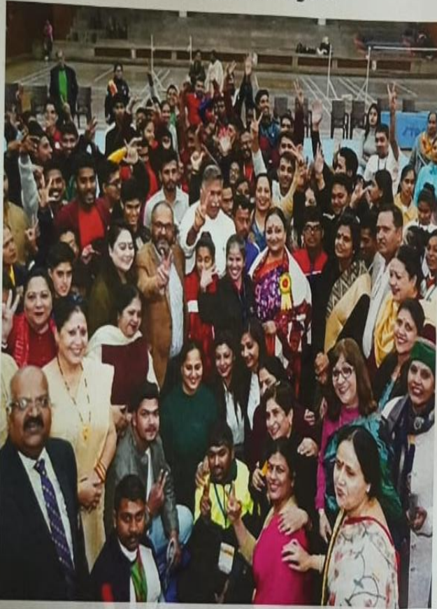
Participants at the event enjoying a photo op with Dr Nadda